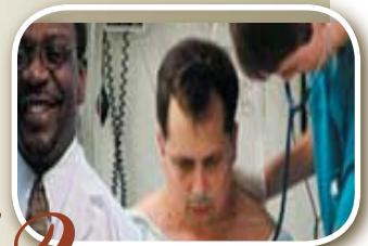
Remaking American Medicine...Health Care for the 21st Century