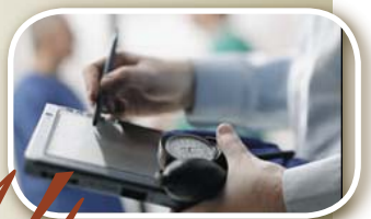
EHR Vendor Fair