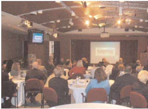
May 2006 NAAC Meeting at AARP Headquarters